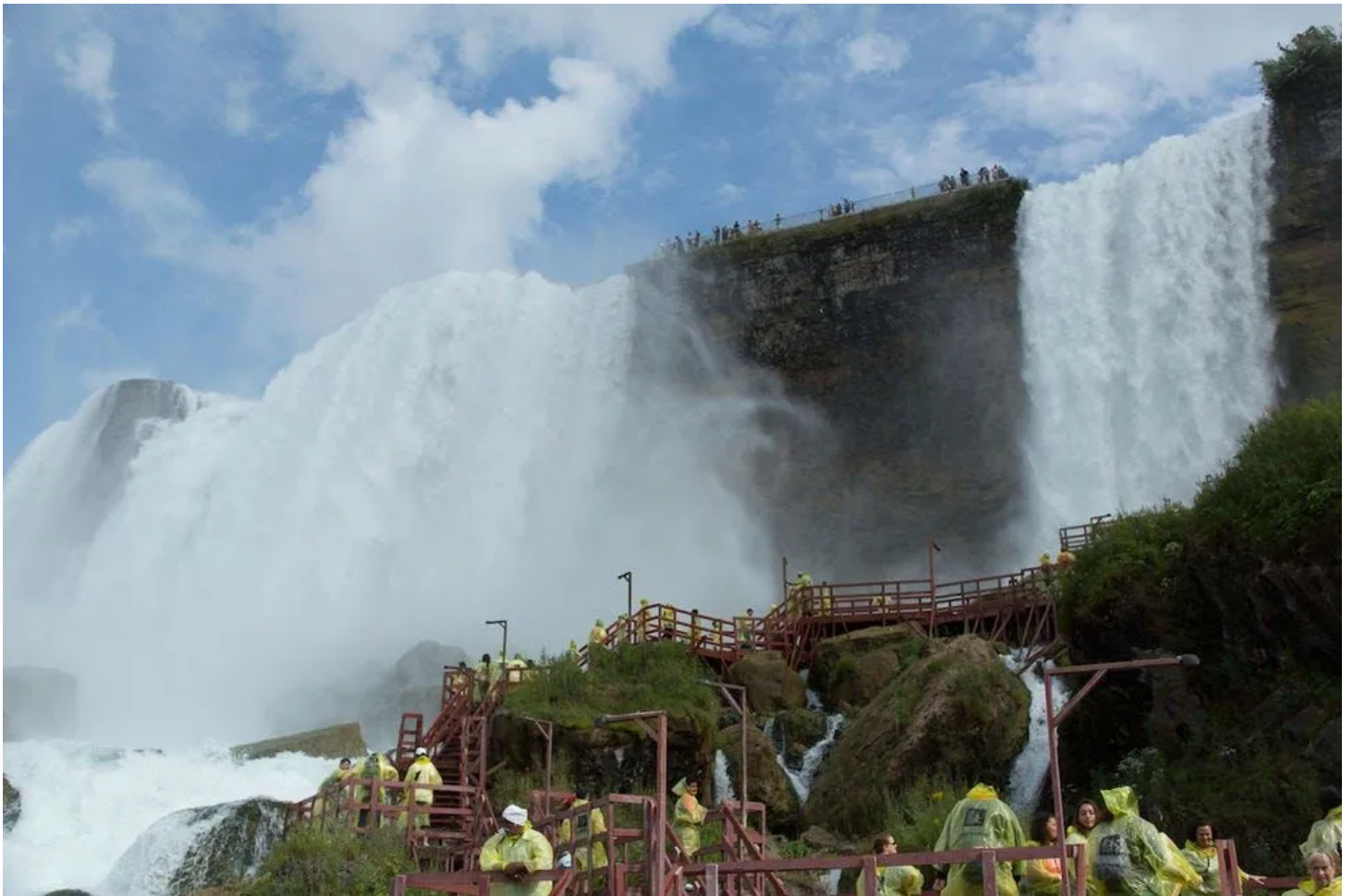
Cave of the Winds gets visitors up close and personal with Niagara Falls

Sure, Canada has the better views of Niagara Falls, but the New York side is a barrel of outdoor fun! From tours through the Cave of the Winds and Pavilion, and along the Niagara River Gorge, to underground boat rides through Lockport Cave, an Industrial Revolution-era tunnel, there are plenty of adventurous ways to experience Niagara Falls.