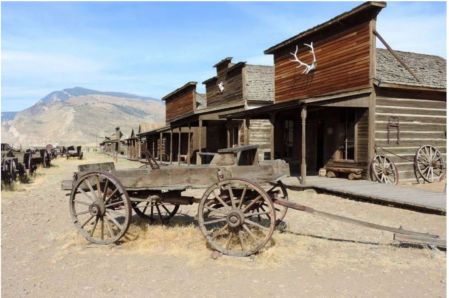
Old West artifacts found in Old Trail Town — Photo courtesy of iStock / Debraansky

For some Old West vibes, head to Cody, Wyoming. Built by William "Buffalo Bill" Cody, the town gives visitors an authentic Western experience. From a world-class museum dedicated to the culture and natural beauty of the region to an indoor shooting range where guests can experience replica rifles, there's plenty to see and do.