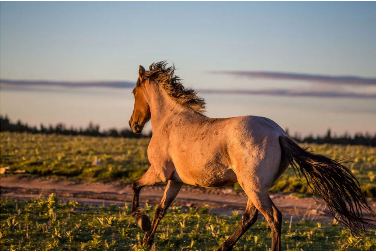
Horses roam free at the Pryor Mountain Wild Mustang Center

For over 200 years, wild horses have roamed Wyoming and at the Pryor Mountain Wild Mustang Center in Lovell, they still run free. Wyoming is known for stunning landscapes, so taking in these vast plains while witnessing wild mustangs is quite the experience.